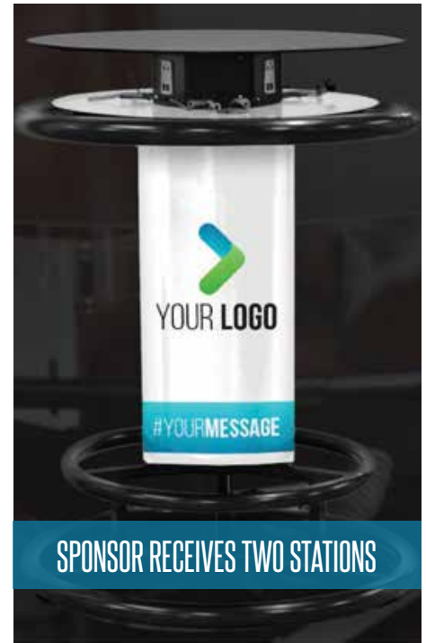
Note: Image representative, actual charging station subject to change.