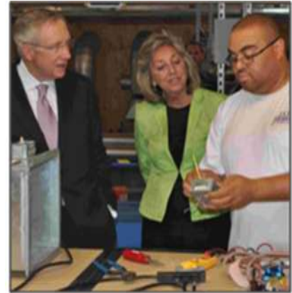
Sen. Harry Reid and Rep. Dina Titus see how it's done in Las Vegas.

As we enter 2011, the Rebuilding America team would like to share with you a brief recap of our work to date toward the goal of retrofitting 50 million buildings with energy efficient technologies by 2020 . Although the 111 th Congress did not pass Building STAR legislation , a federal rebate program for commercial building energy efficient retrofits, Rebuilding America did make progress. We developed a diverse and powerful coalition consisting of over 100 partners representing the business, labor, manufacturing, real estate, and contracting sectors. We organized a number of high-level field events designed to bring the Rebuilding America message to lawmakers in their states and districts. Most importantly, we succeeded in raising the visibility and importance of commercial building energy efficiency.